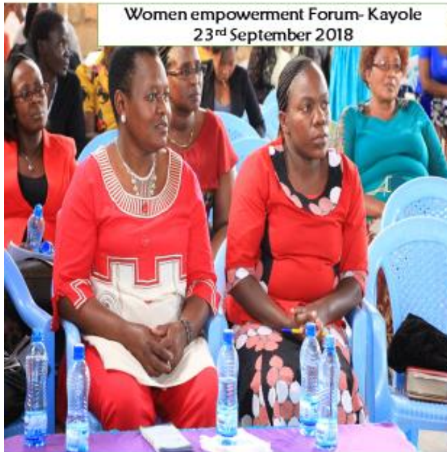
Women empowerment Forum- Kayole 23 rd September 2018