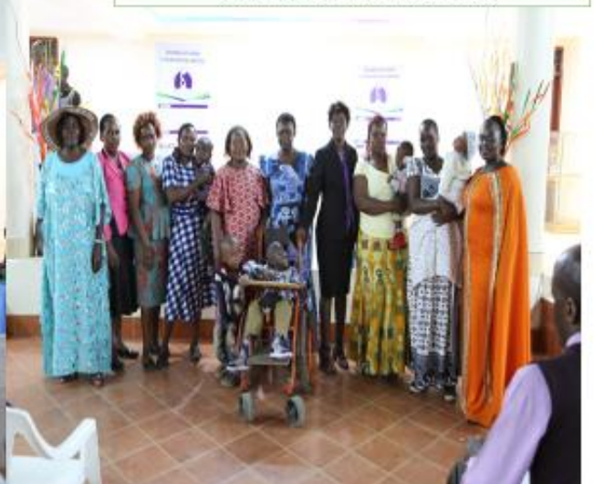
Mothers with children living with Disabilities exited for the transformation delivered by WOFF team.