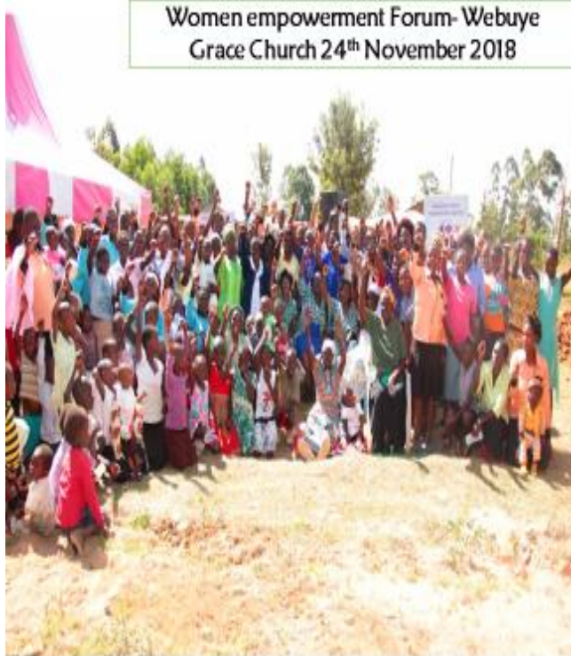
Women empowerment Forum- Webuye Grace Church 24 th November 2018