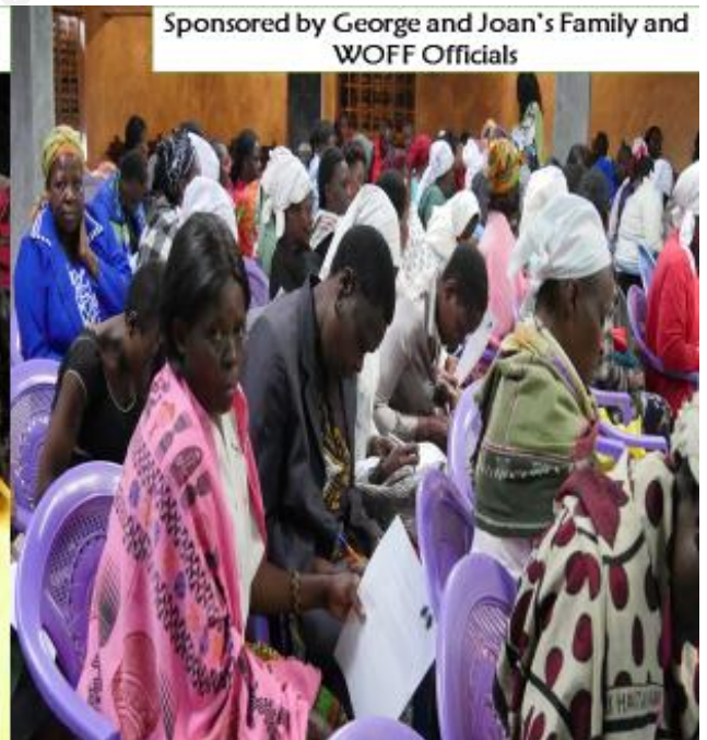
Women fill questionnaires for data collecting