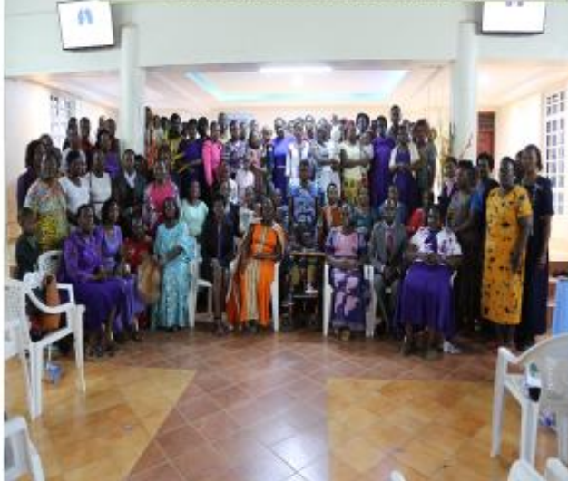
Women from Dandora pose for a group photo after empowerment forum