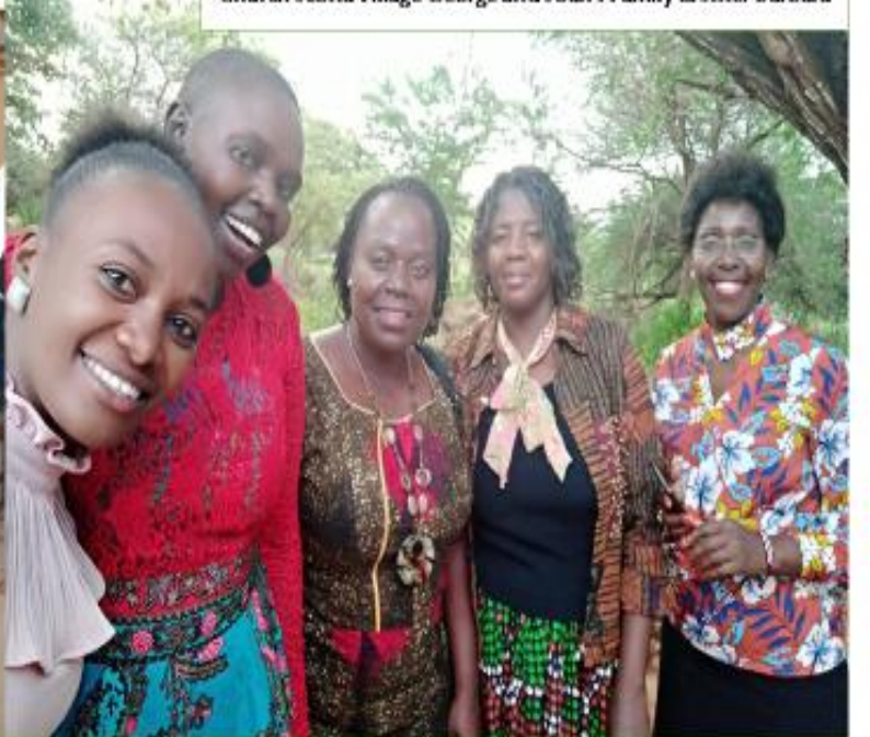
WOFF Officials pose for a photo after successful empowerment forum